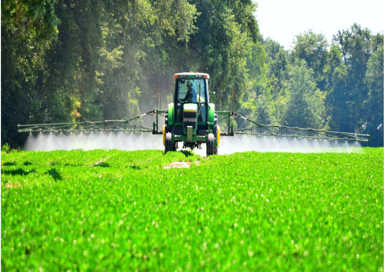
Spraying Agrinos HYT® Product on Peanuts Florida