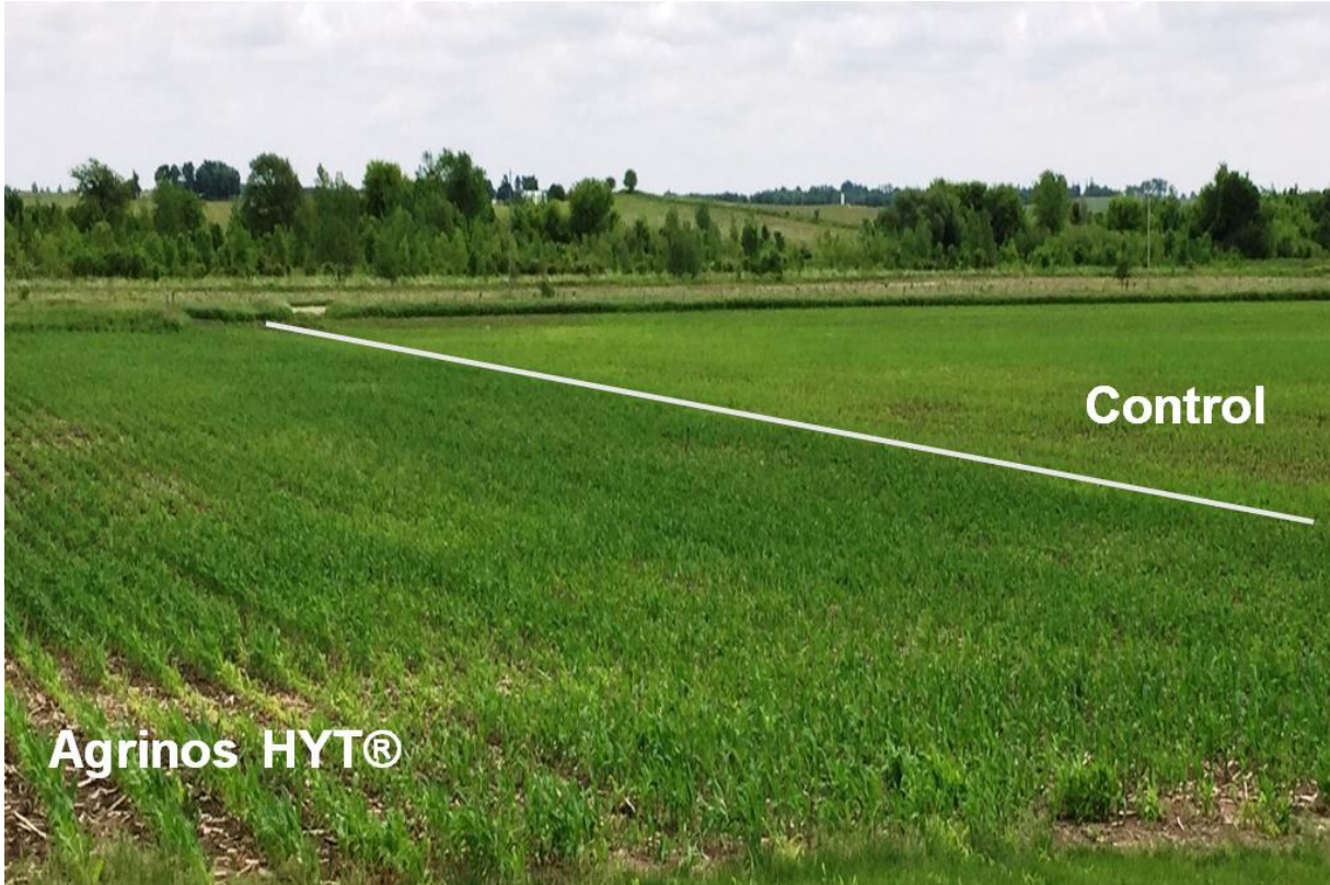
Agrinos HYT® Results Following Application to Corn in Iowa 2015